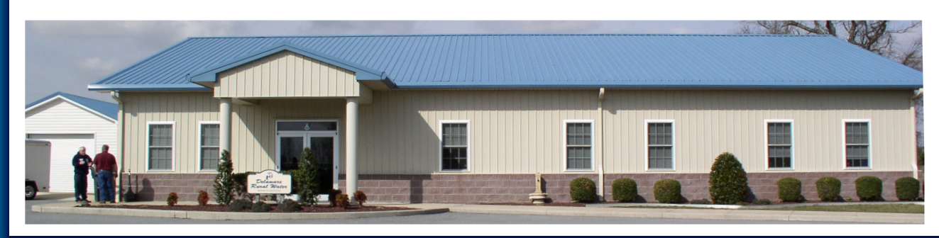
For more classes and information visit us at www.drwa.org

DRWA's On-Site Training Unit (OSTU) was developed in cooperation with the Office of Drinking Water and funded through an EPA grant. The unit has classroom space, resource materials, and industry equipment. DRWA has traveled around the state to operators who can't leave their systems to attend training. Hands-on training has been provided for water testing, meter testing, cross-connection, fluoridations, well security and more.